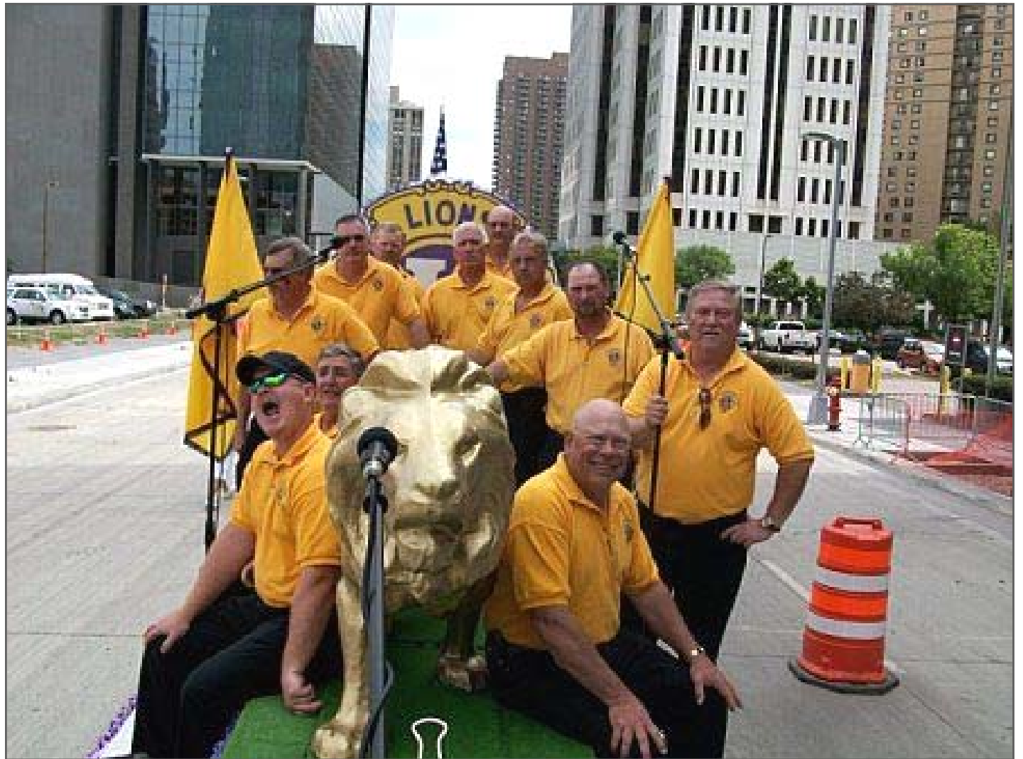
The Ettrick Lions Club Chorus in the International Lions Parade