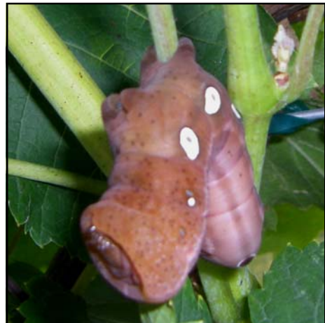
I couldn't resist taking a photo of this caterpillar...