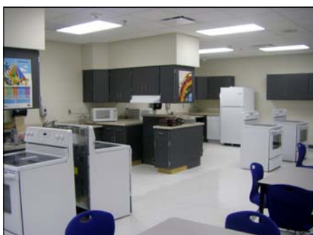
Consumer Education Room