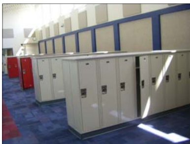
Each grade has their own 'pod' with lockers..