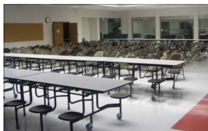
Above is a snapshot of the commons area and kitchen area.