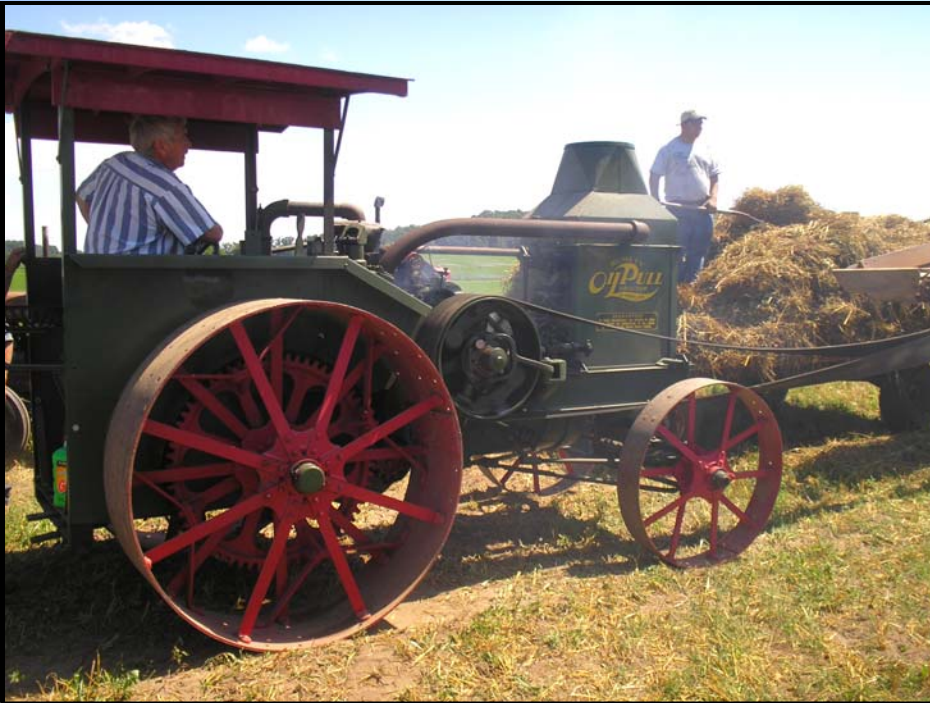
This is a Rumley Oil Pull tractor.

It used to be that the old Oil Pulls ran on Kerosene and water...so I am assuming that this one does too. It was working at a Threshing Bee at Coral City's Old Ag Day. It was working with a 100 Year old MacCormack-Deere All-wood threshing machine, on the right